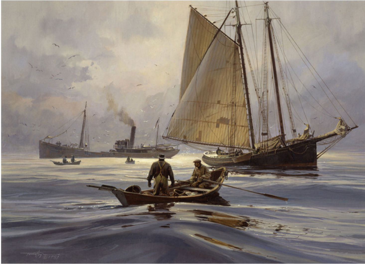
New Ways on the Banquereau, 1981 Thomas Hoyne